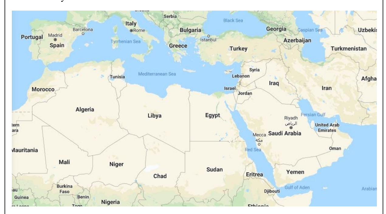
Map from Google Maps: https://www.google.com/maps/place/Middle+East/

Where did shakshuka come from? The dish as we know it is North African in origin, although it may have descended from the Ottoman Empire's saksuka, which did not include tomatoes but did feature meat; today, shakshuka is most strongly associated with the Middle East and Israel in particular, where it was introduced by Jewish immigrants from Tunisia, Morocco, Algeria, and Libya. It's always been an affordable, filling, and undemanding meal, so it's no wonder it's only kept gaining in popularity all over the world. Its inclusion in renowned Israeli chef Yotam Ottolenghi's 2011 cookbook "Plenty" helped spread the word, and nowadays, Instagram is a steady source of tantalizing shakshuka shots. You're apt to find shakshuka on even the fanciest brunch menus these days, but while some places may have the nerve to sell it for $20 and up, there's zero pretension when it comes to the dish. You can even buy it in meal kit form, but you really don't need to. You barely need a recipe, and then only the first time you make it.